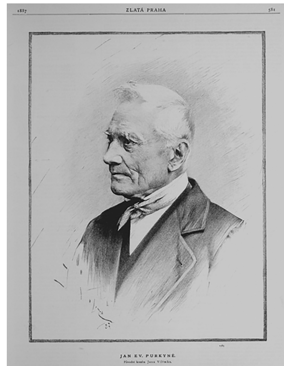
Fig. 1. Jan Evangelista Purkyně (1787–1869).

Jan Evangelista Purkinje (Fig. 1) died on July 28, 1869, at noon. The announcement of Purkinje's death in the Prague